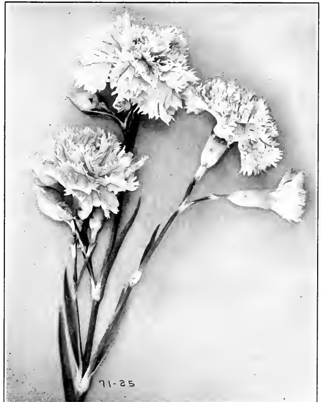
CARNATION—CHABAUD'S GIANT DOUBLE